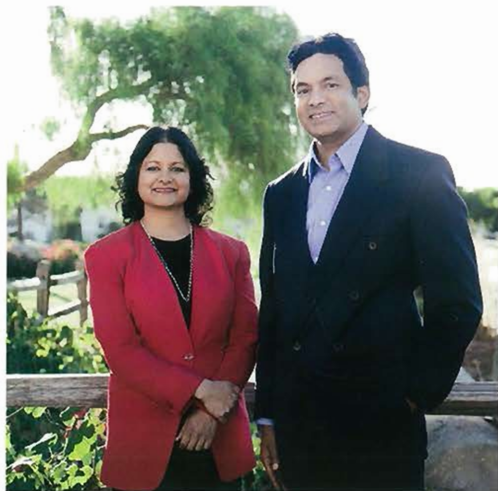
The Chari Center of Health was formed more than 14 years ago in San Diego and relocated to Santa Barbara in 2009.